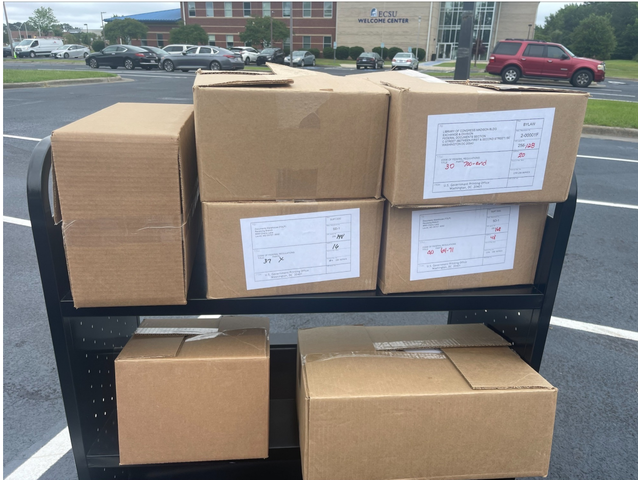
Photo shots of the items from the trip to LOC